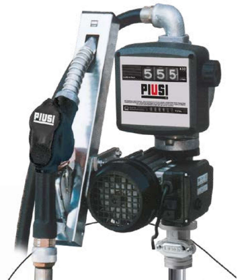
DRUM PANTHER 56 K33