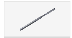
TELESCOPIC SUCTION HOSE