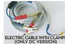
ELECTRIC CABLE WITH CLAMPS (ONLY DC VERSION)