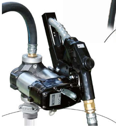
DRUM BIPUMP 12V