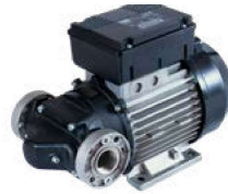
AC PUMP - E120