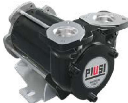
DC PUMP - BP3000