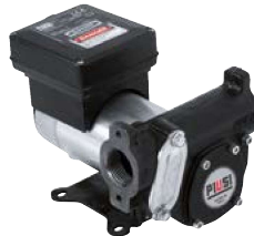
DC PUMP - PANTHER DC