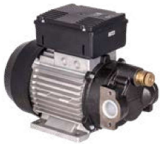
AC PUMP - VISCOMAT VANE