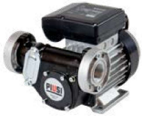
AC PUMP - PANTHER