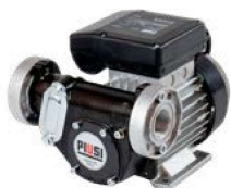
AC PUMP - PANTHER 56/72