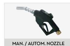
MAN. / AUTOM. NOZZLE