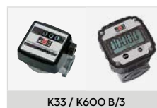
K33 / K600 B/3