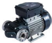
AC PUMP - E80/E120