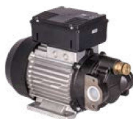
AC PUMP - VISCOMAT 70/90