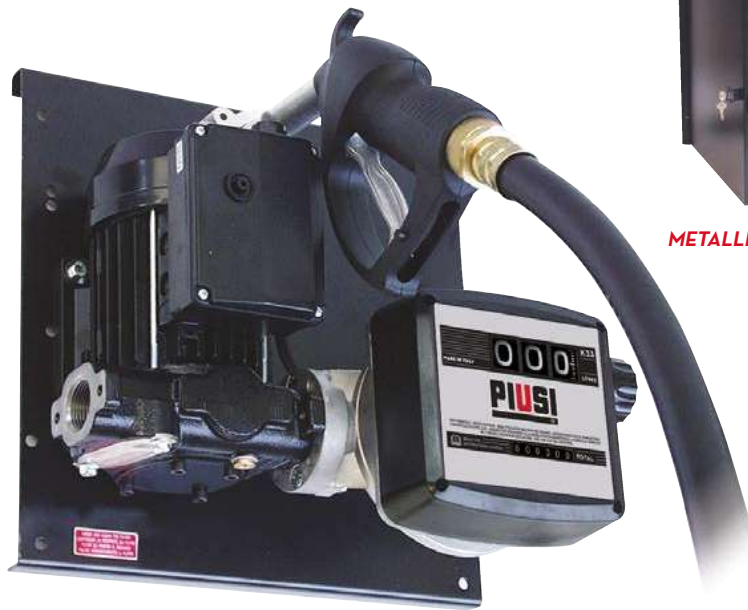
ST WITH METER