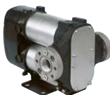
DC PUMP - BIPUMP