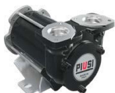
DC PUMP - BYPASS 3000