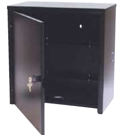
METALLIC BOX (optional)