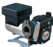
DC PUMP - PANTHER DC